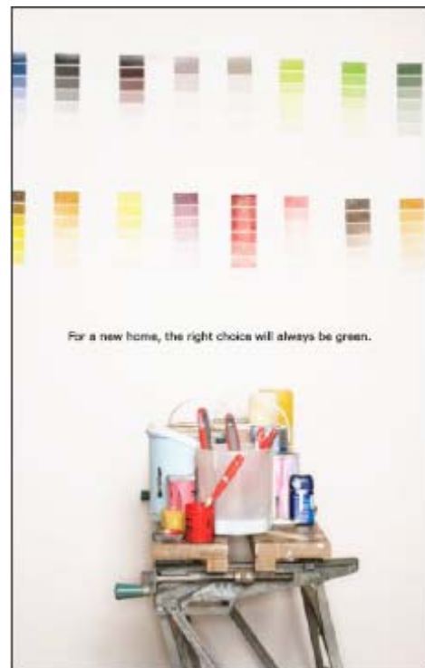
Code-plus Builder Post Card

For more information, contact ICF International by phone at (818) 325-3128 or e-mail: CANHP@icf.com