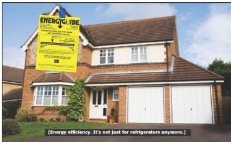
ENERGY STAR Builder Post Card